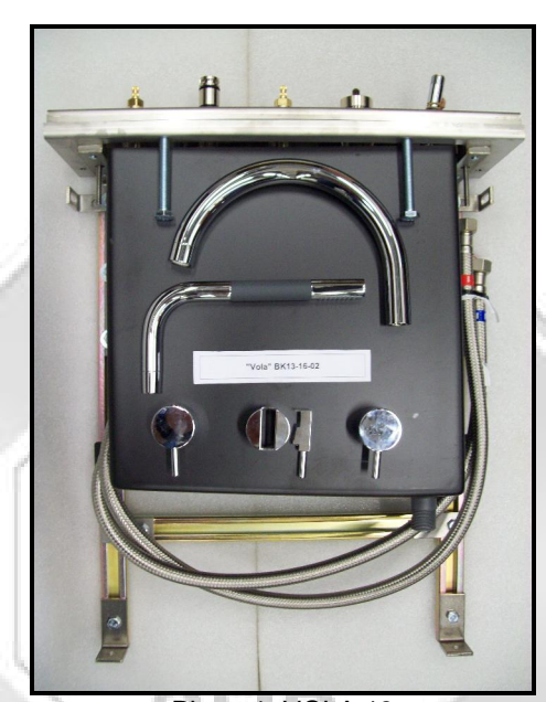
Photo 1. VOLA 13 Thermostatic mixer for bath filling and mixer with hand shower